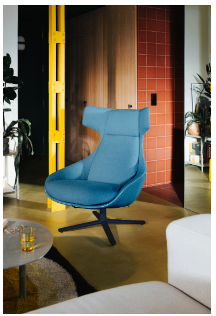
This is a comfortable and elegant armchair that is ideal for a quiet corner at home, or as part of waiting rooms or receptions in hospitality and work areas. It can be combined with the ottoman from the same collection for greater comfort.