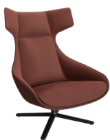
4R REVOLVING TILTING