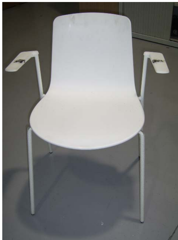
Chair with 4 legs with armrests

On the 29 th of March CIDEMCO received a « LOTTUS » series chair from the company ENEA-EREDU S. COOP, with the following characteristics: